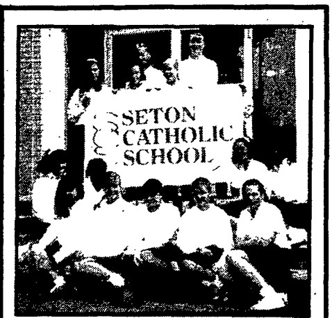
CYO SOFTBALL CHAMPIONS — The Seton Junior High School softball team recently won the Catholic Youth Organization Championship and brought home the best record — 13-1 — in the school's history.

A $5 offering for each session would be appreciated. For information, call 716/728-2228.