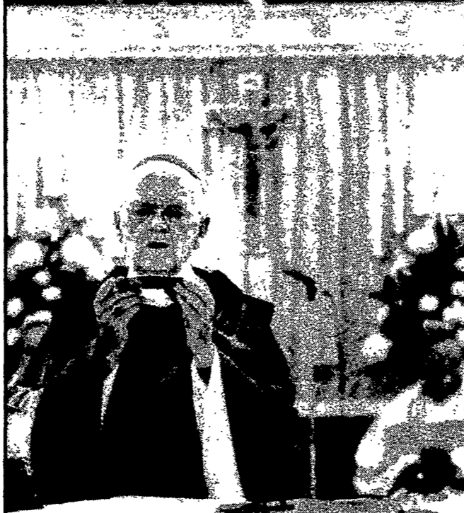
The golden-anniversary celebration began with a concelebrated Mass at Holy Family Church.