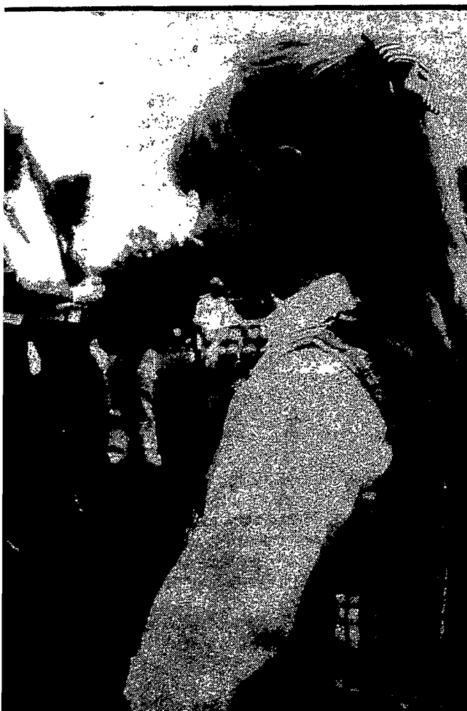
St. Mary's School, looks on as honor guards from both World Wars march in the procession after Mass.