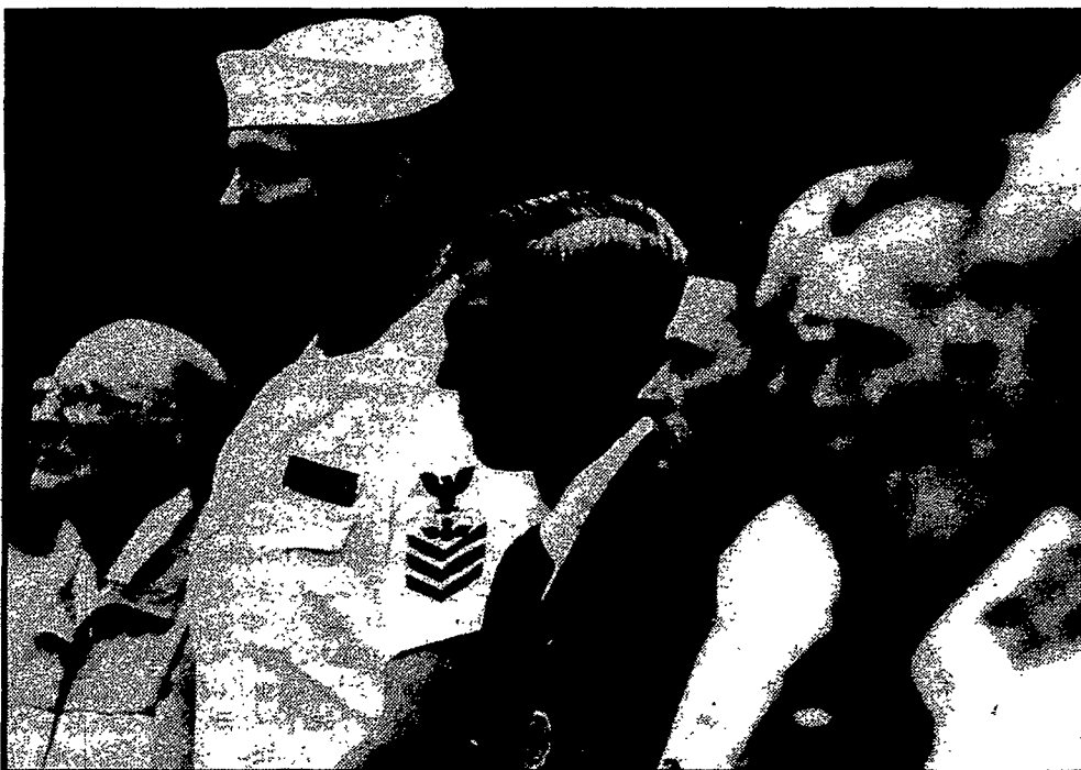
Former and current servicemen and women paid tribute to their fellow soldiers during the May 30 Mass. Residents of Waterloo marked the 125th anniversary of Memorial Day with religious services, parades and historical displays.

DEVOTION: to Our Lady of Fatima; Guardian Angels Church, 1960 E. Henrietta Rd., Rochester; 9 a.m.