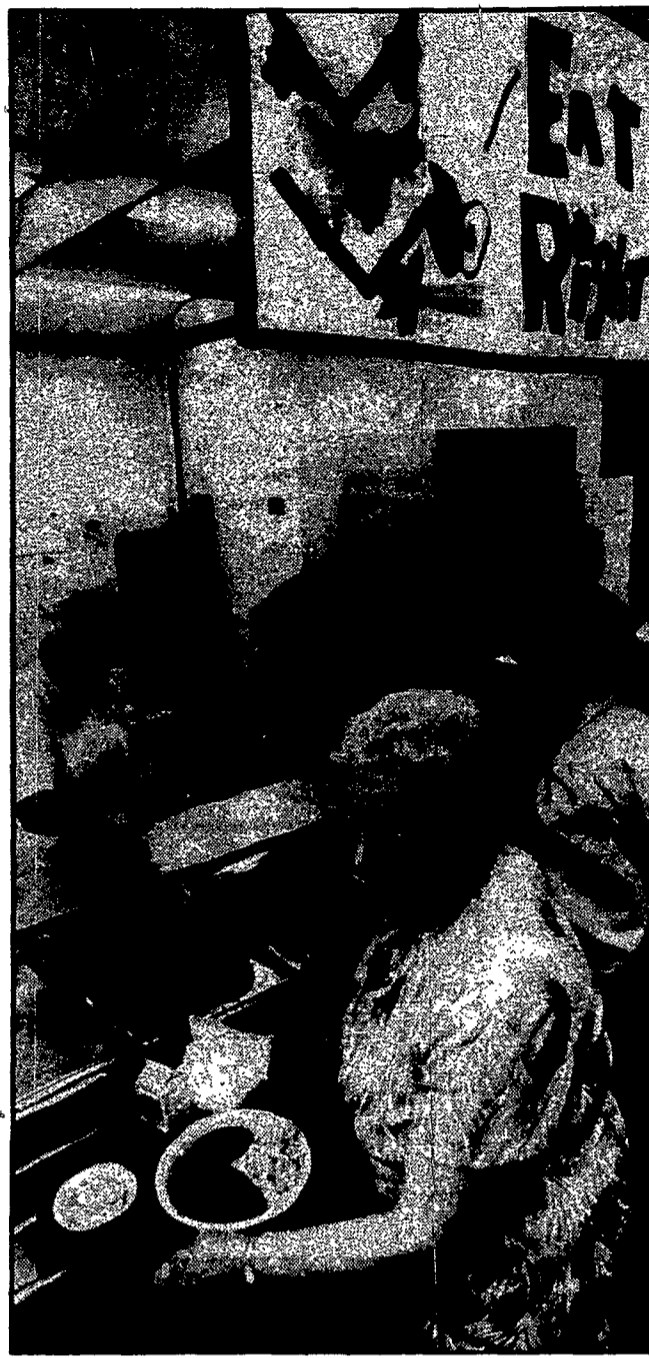
A lunch put together by a dietitian employed by Monroe County is served Monday through Friday at the 700 North Street Senior Center.