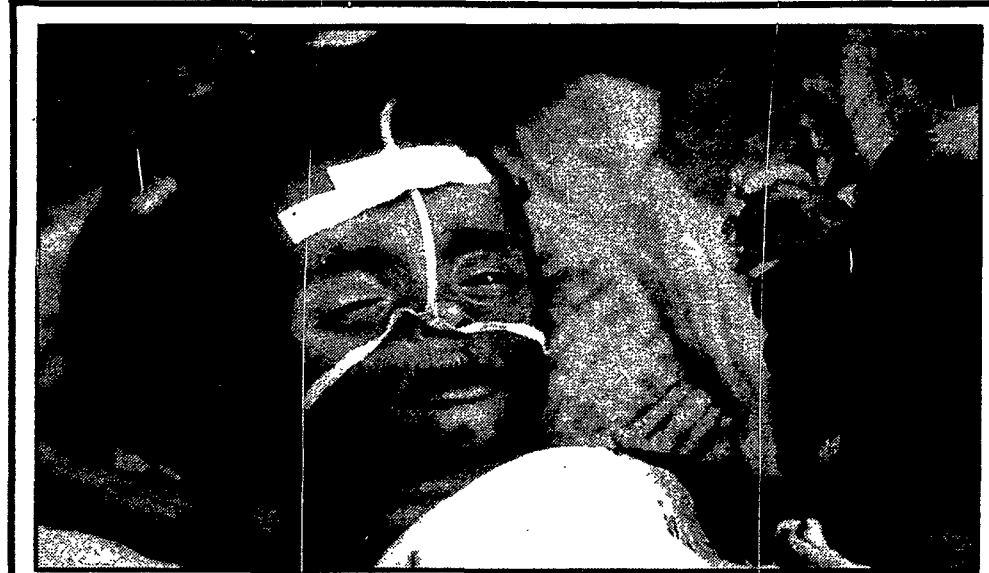
MALNOURISHED CHILD — A Somali mother comforts her baby as flies swarm over his malnourished body in a medical tent set up by an international relief agency in Teferiber, Ethiopia May 23. Officials estimate that 10 refugees are dying every day in the camps, which are being flooded by thousands of exiles.