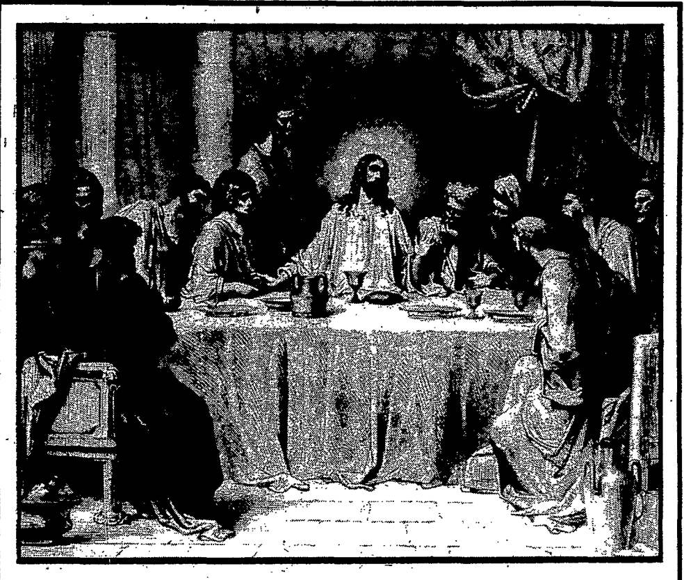
HOLY THURSDAY — The Last Supper by Gustav Dore, regarded as one of the great masterpieces of religious art, commemorates Holy Thursday and the institution of the Holy Eucharist.