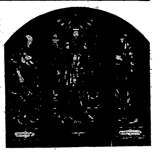
After the Assumption of Mary, Jesus crowns her Queen of Heaven.

MEETING: support group for abused older people; Regional Council on Aging,