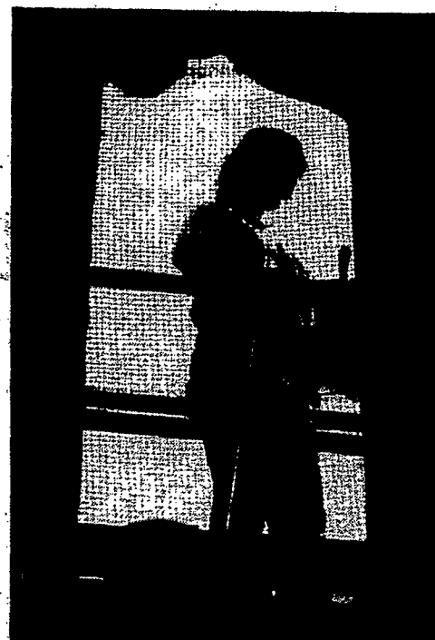
The bell tower, which has been silent since 1989, is still under construction. Four thousand bricks damaged by water are being individually replaced.

RECEPTION: for new parishioners and families of recently baptized at Our Lady of Good Counsel; Scutari Hall, 640 Brooks Ave., Rochester; following 11 a.m. Mass;