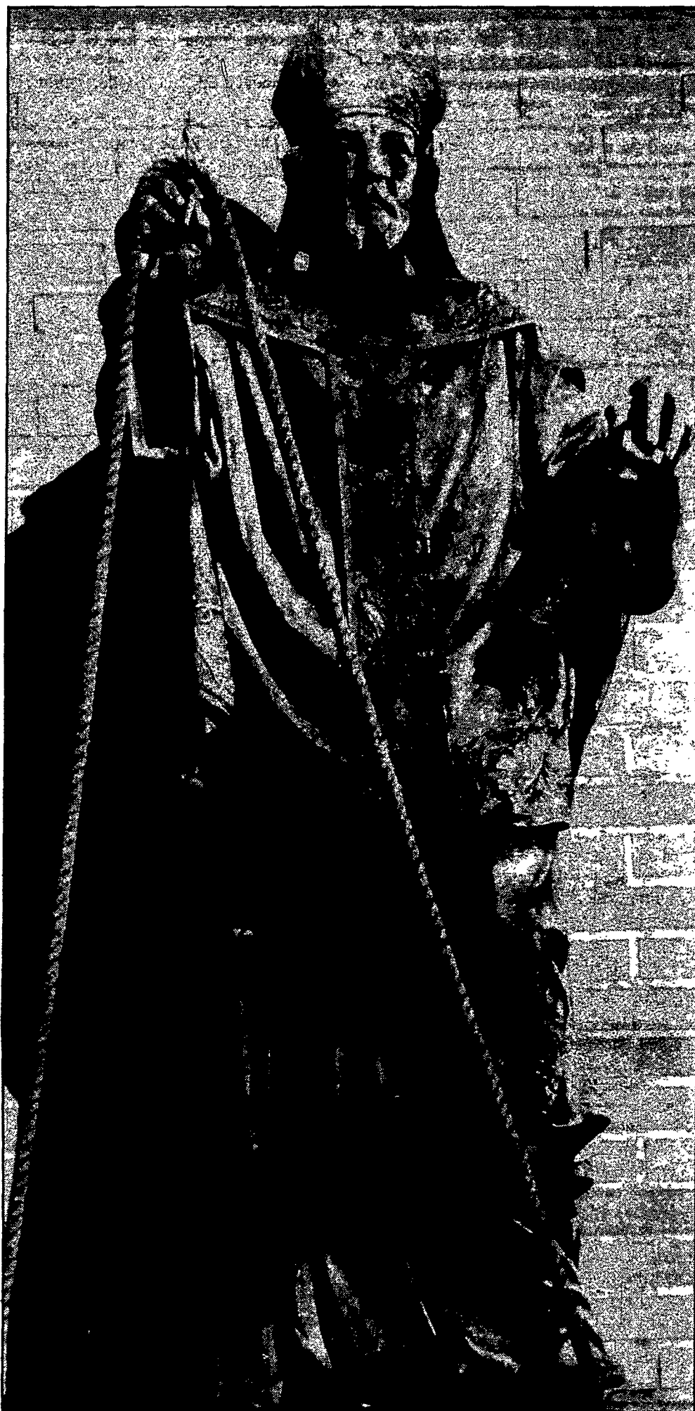
This statue of St. Augustine, which was recently acquired from St. Bernard's Seminary, lends a hand to scaffolding ropes.

SOCIAL: Dinner Night sponsored by St. Thomas More Singles Club; Mama Rosa's, 1733 Norton St., Rochester; 7:30 p.m.; call 716/482-5656.