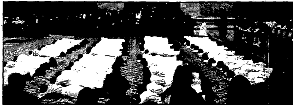
Above, 60 deacons prostrate in humbleness before the altar in St. Peter's Basilica. Below, Pope John Paul II presides over the presentation of deacon candidates.