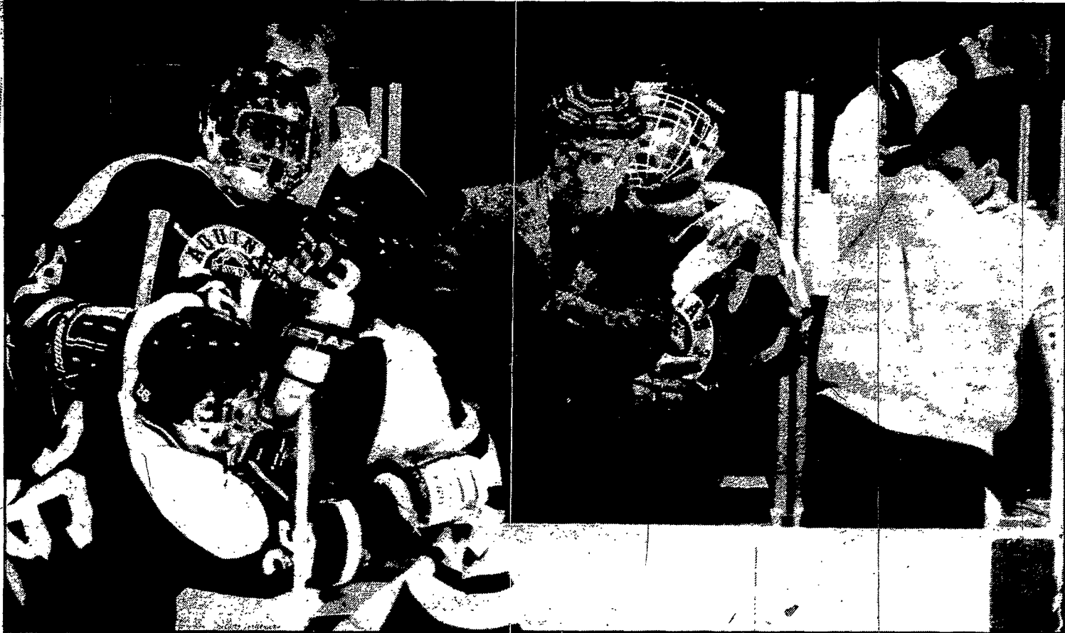
Aquinas players and coaches brace for a collision between two players near the bench during the Little Irish's 2-1 Monroe County Hockey League win over the Knights.