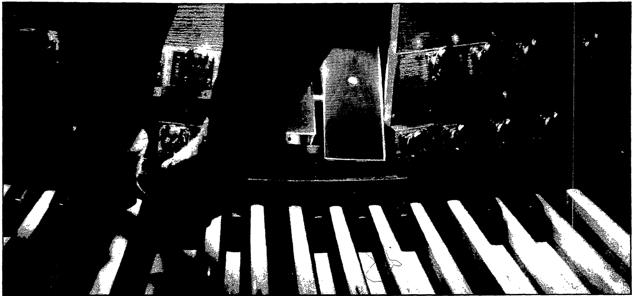
Special soft leather shoes are required to play the pedals of an organ.