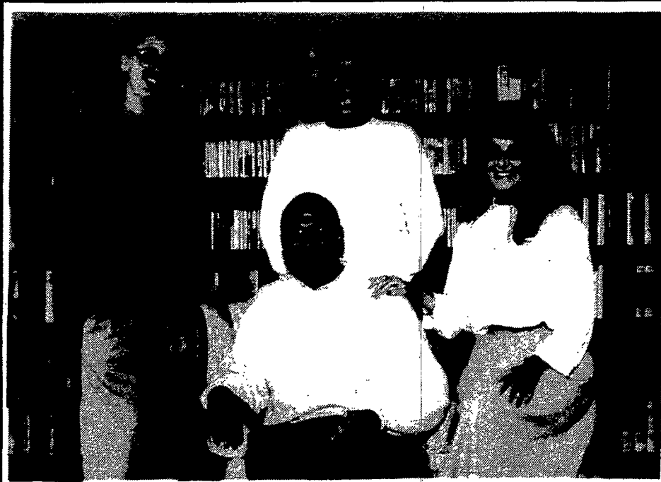
Graduate of: Aquinas Institute and St. John Fisher College Active member of Holy Cross Church

The street is no solution. Old problems get worse, and new ones are created.