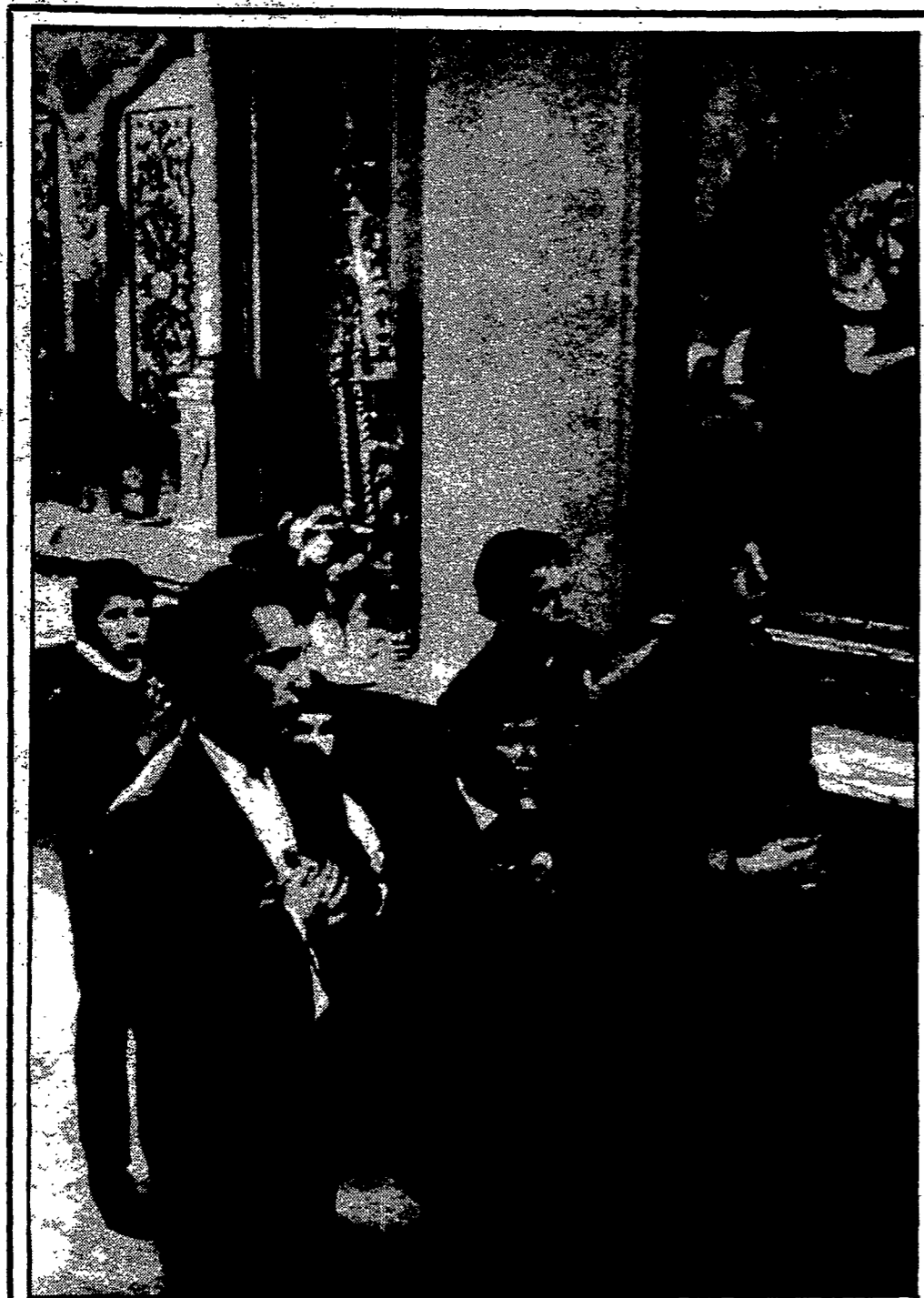
RENEWING THE FAITH — Choir boys learn prayers at the St. George Cathedral in the western Ukrainian city of Lvov, Oct. 10. The youths are members of the formerly banned Ukrainian Catholic Church, and the cathedral — which was confiscated 1946 when Stalin banned Catholicism — was returned to the faithful in August.