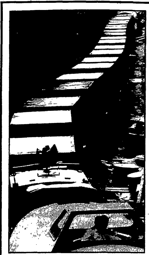
RAIL TO DESTRUCTION — Departing Sept. 12 from Kaiserslautern, the first load of U.S. chemical-weapon shells makes its way out of West Germany. When they reach their final destination — the Johnston atoll in the Pacific Ocean — the shells will be destroyed.

The New York Times reported recently that this November's gubernatorial elections around the country will include at least four races pitting Democratic abortion foes against Republican abortion backers — a reversal of traditional party alignments which the newspaper called "an illustration of how complex the issue's political impact has become."