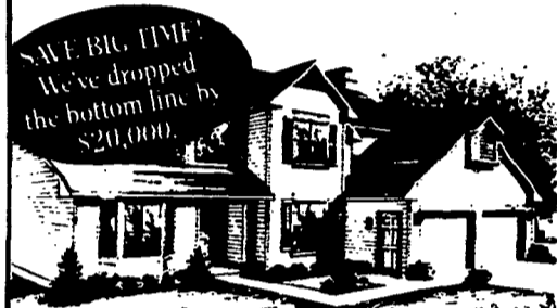
SAVE BIG TIME! We've dropped the bottom line by $20,000. The New American Family Homes

The James Group is hosting a Harvest Festival on September 16 (rain date Sept. 23) to announce the opening of Section II of select home sites at Whispering Winds. There will be food and fun, enough for everyone. Free gift packs for each family, pony rides for the kids, a tethered hot air balloon and all the fixin's for a country picnic. Donations will be accepted and all money raised will be given to St. Joseph's Villa. Don't pass up this invitation to a day full of fun. It's a special opportunity to see Whispering Winds and to get all the details on how you can save over $20,000 off the bottom line of our top four home designs featured below. See you there!