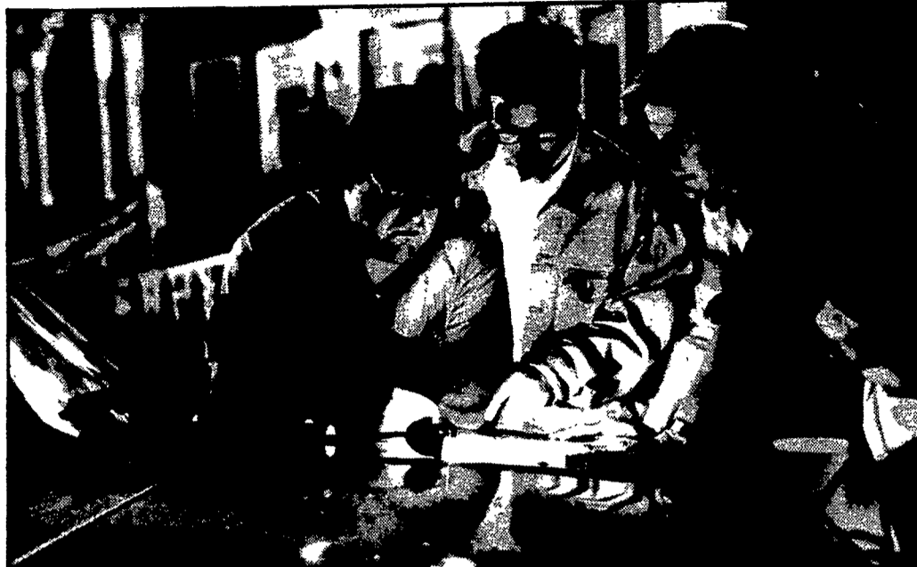
In 'Arachnophobia,' exterminator Delbert McClintock (John Goodman, left) plans an attack against invading spiders, with the help Dr. Jennings (Jeff Daniels, right) and an entomology student.

Actor John Goodman provides the primary comic relief as the glib exterminator who introduces himself to the world-famous entomologist Atherton as a