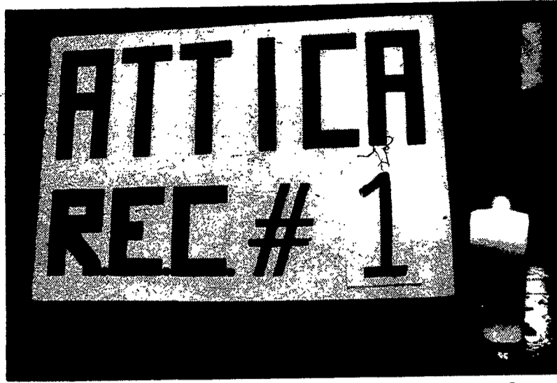
Eight years ago, volunteers from a REC at Auburn State Correctional Facility designated this candle for the first such retreat to take place at Attica.