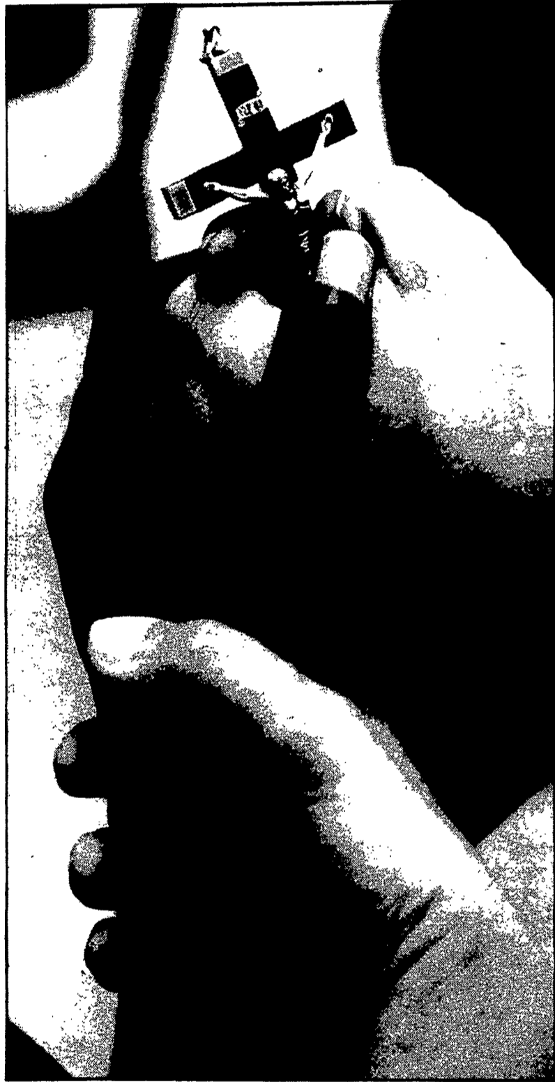
Prayer sessions enable each participant to focus on his personal spirituality, with the support of others.