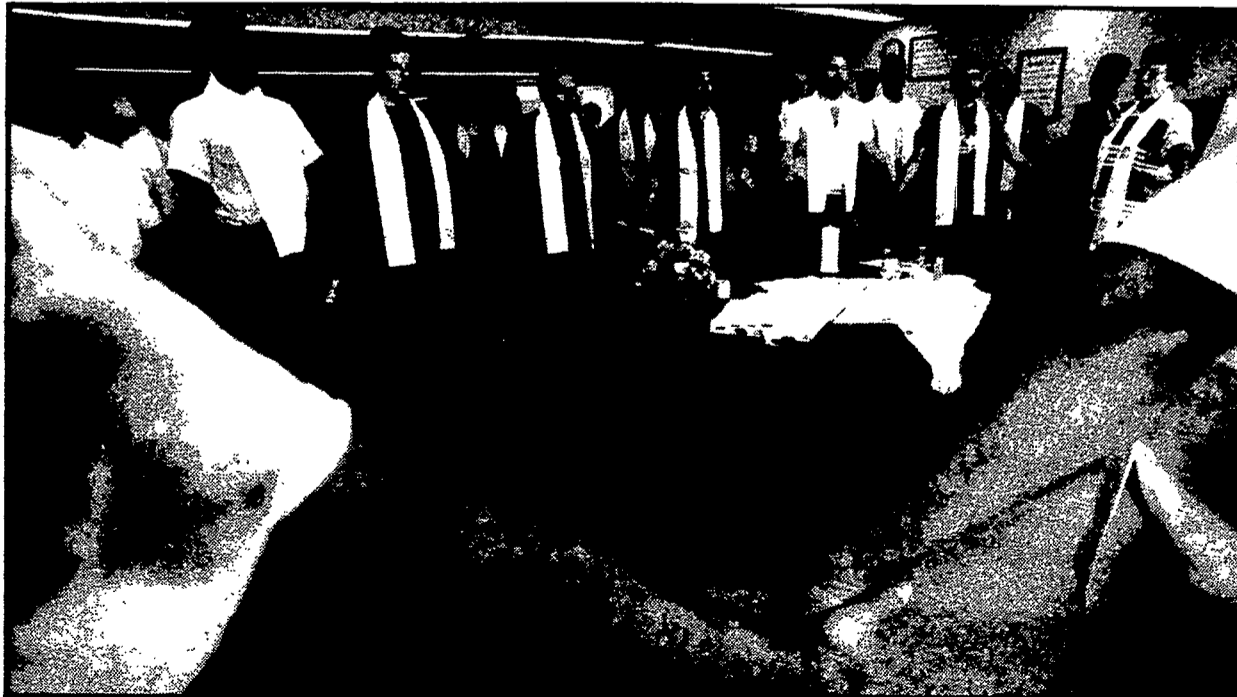
The REC group — 22 volunteers and 34 inmates — celebrated Mass together in a visitors' room, which was set aside for the three-day retreat.