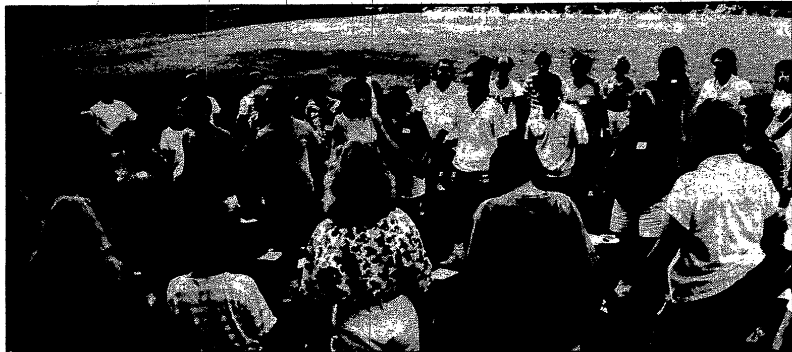
Young adults hold hands while reciting the Lord's Prayer at a communion service July 28 at Mendon Ponds Park. The service was part of an annual gathering for young adults throughout the diocese, sponsored this year by four diocesan parishes.