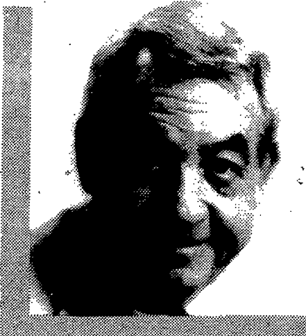
TV Celebrity Tom Bosley

Introducing new technology that's music to your ears: The new Electone Rechargeable hearing instruments.