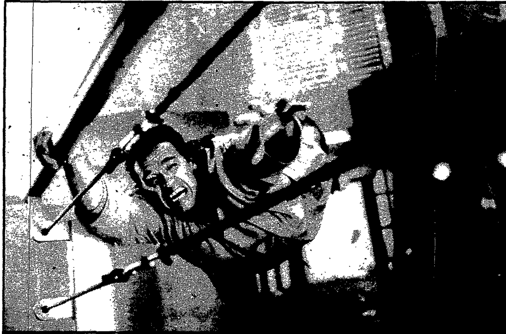
Tremendous winds rushing out of a Martian space port push Doug Quaid (Arnold Schwarzenegger) to near death in "Total Recall."

Due to wanton disregard for human life in countless scenes of excessive, gory violence, sexual exploitation and rough language, the U.S. Catholic Conference classification is O — morally offensive.