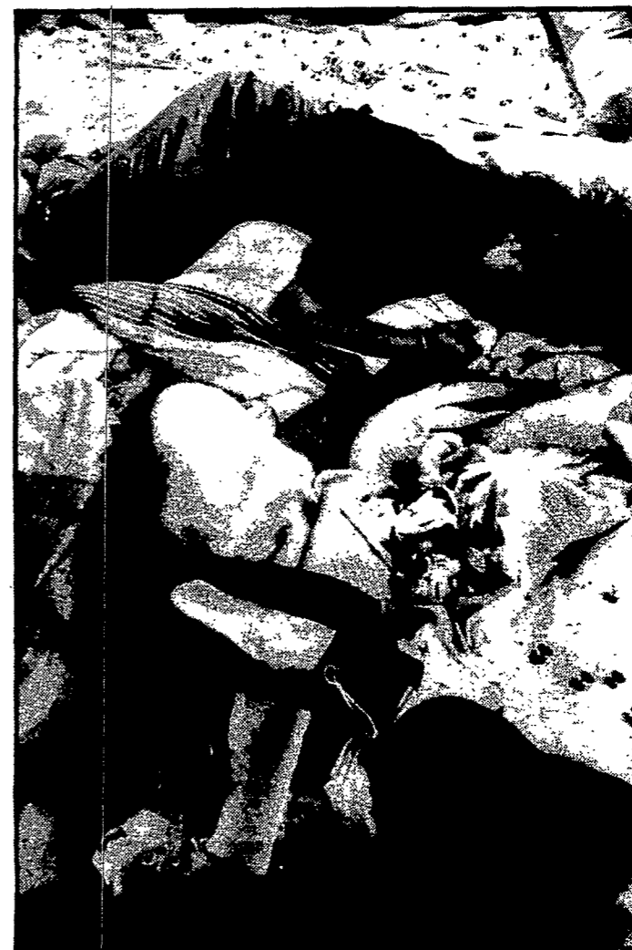
An exhausted Tracey Hamilton takes time for a nap amid a sea of sleeping bags in a classroom-turned-dormitory.