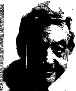
TV Celebrity Tom Bosley

Introducing new technology that's music to your ears: The new Electone Rechargeable hearing instruments.