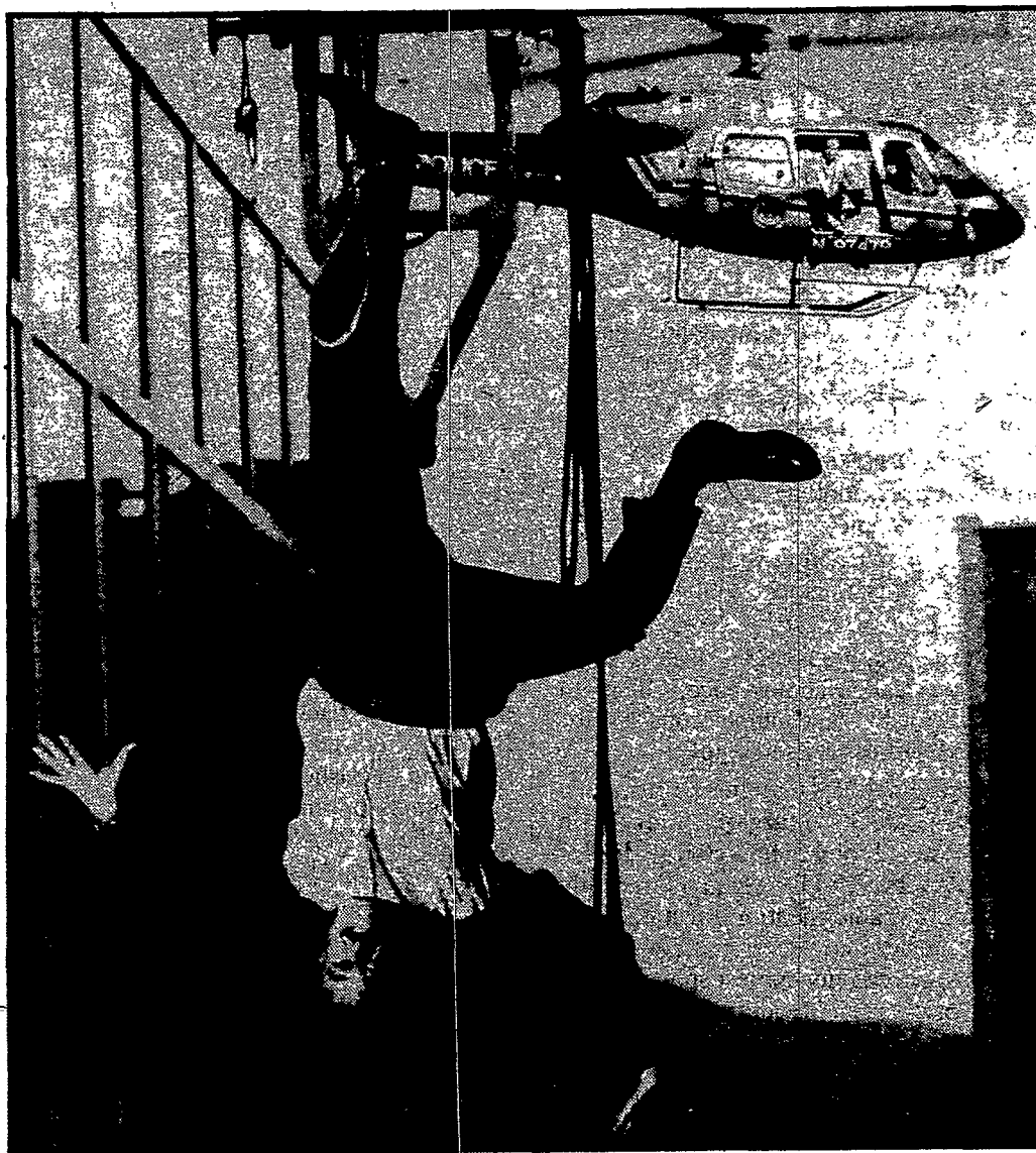
Dabney Coleman is Burt Simpson, a cautious policeman who becomes a daredevil super-cop when he's handed the wrong medical diagnosis, and Matt Frewer (background) is his flabbergasted partner, Ernie, in the new comedy from Gladden Entertainment "Short Time."

495 North Winton Road Rochester, NY 14610 (716) 482-0400