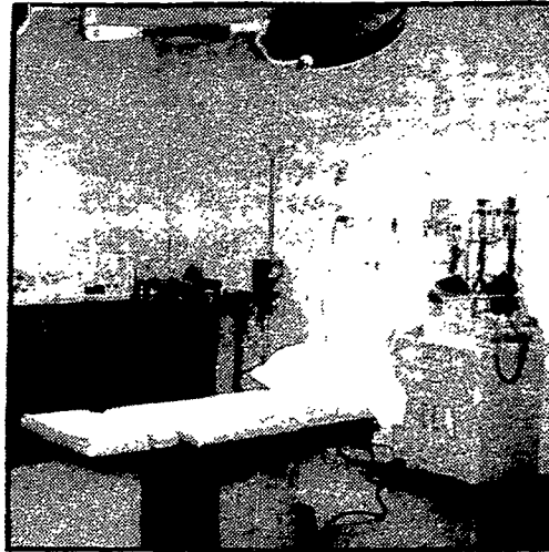
Shown above is one of St. James Mercy Hospital's five new operating rooms. The new emergency department, patient registration, surgical suite and intensive coronary care unit opened in November, 1989. At left is an operating room at St. James Mercy around 1940.