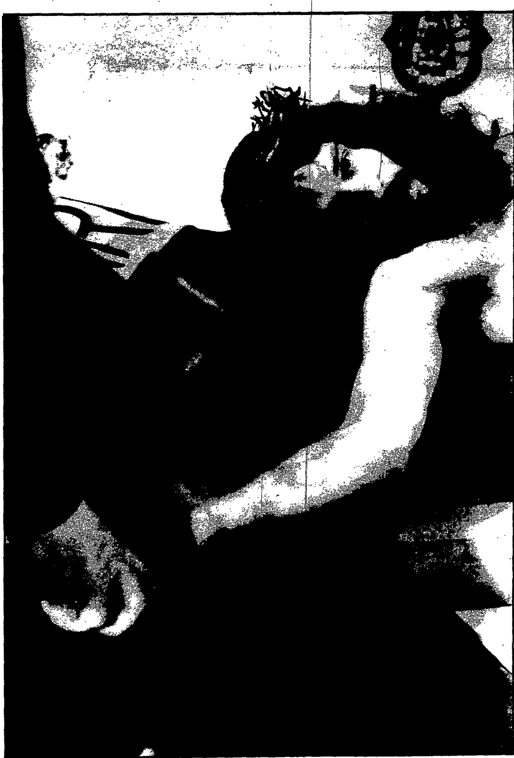
Jesus is nailed to the cross in the eleventh station of the cross.