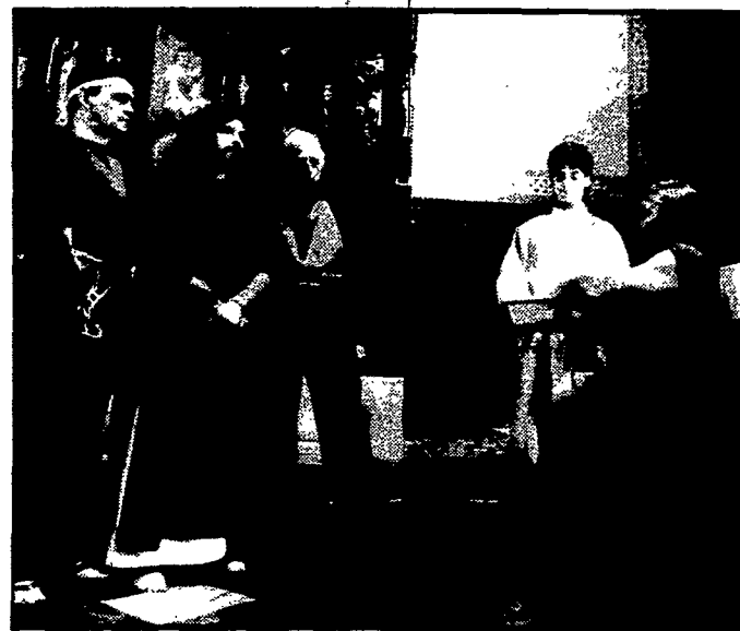
Jesus is condemned to death by Pontius Pilate.