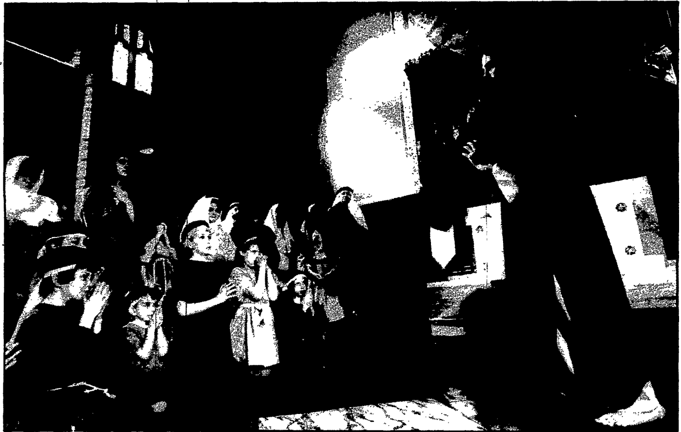
Jesus speaks to the women and children of Jerusalem in the eighth station of the cross.