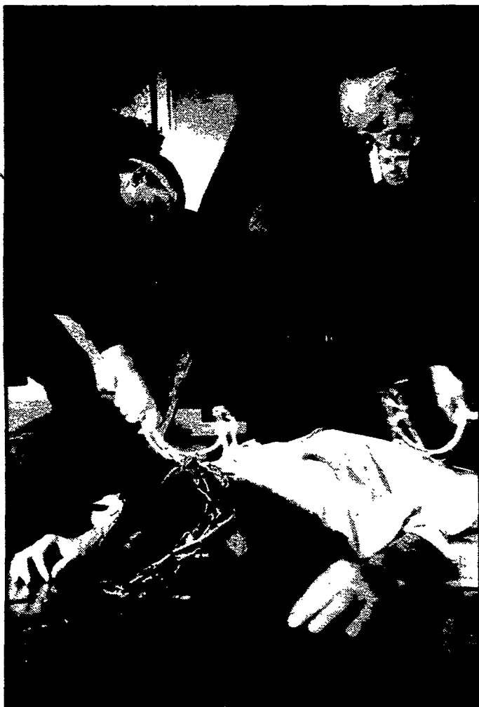
Jesus falls for the third time.