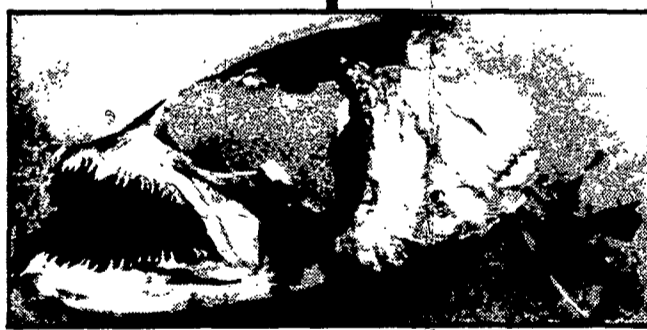
FISH STORY — Hooked off the shore of Lake Ontario, these fish were left on the beach to die. Their carcasses remind spectators that as Great Lakes fish grow older and larger, they absorb more and more toxins from their environment. Last week, the Sierra Club warned pregnant women to avoid eating fish from Lake Ontario, and cautioned others to keep their consumption to a minimum.