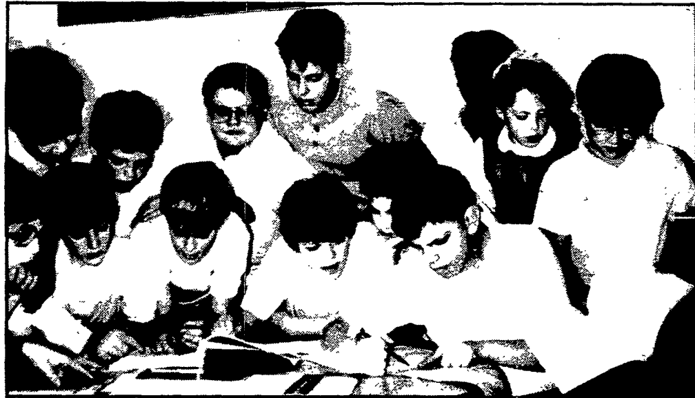
YOUNG BROKERS — The championship team from St. Agnes School, Avon, plans their next stock market move. The students won first place in the fall Gannett Newspaper Stock Market Contest.