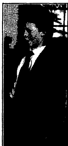
Smart Fashions for Young Men and Boys

Hours: T, W, F 10-5:30 Th 10-8; Sat 10-5; Mon by appt.