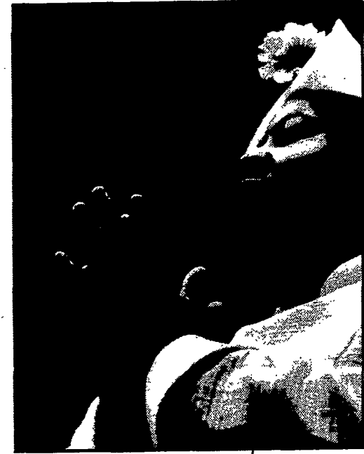
Marilyn Bellamy sings praises to the Lord as an usher in a scene from "Your Arms ... Too Short to Box with God."