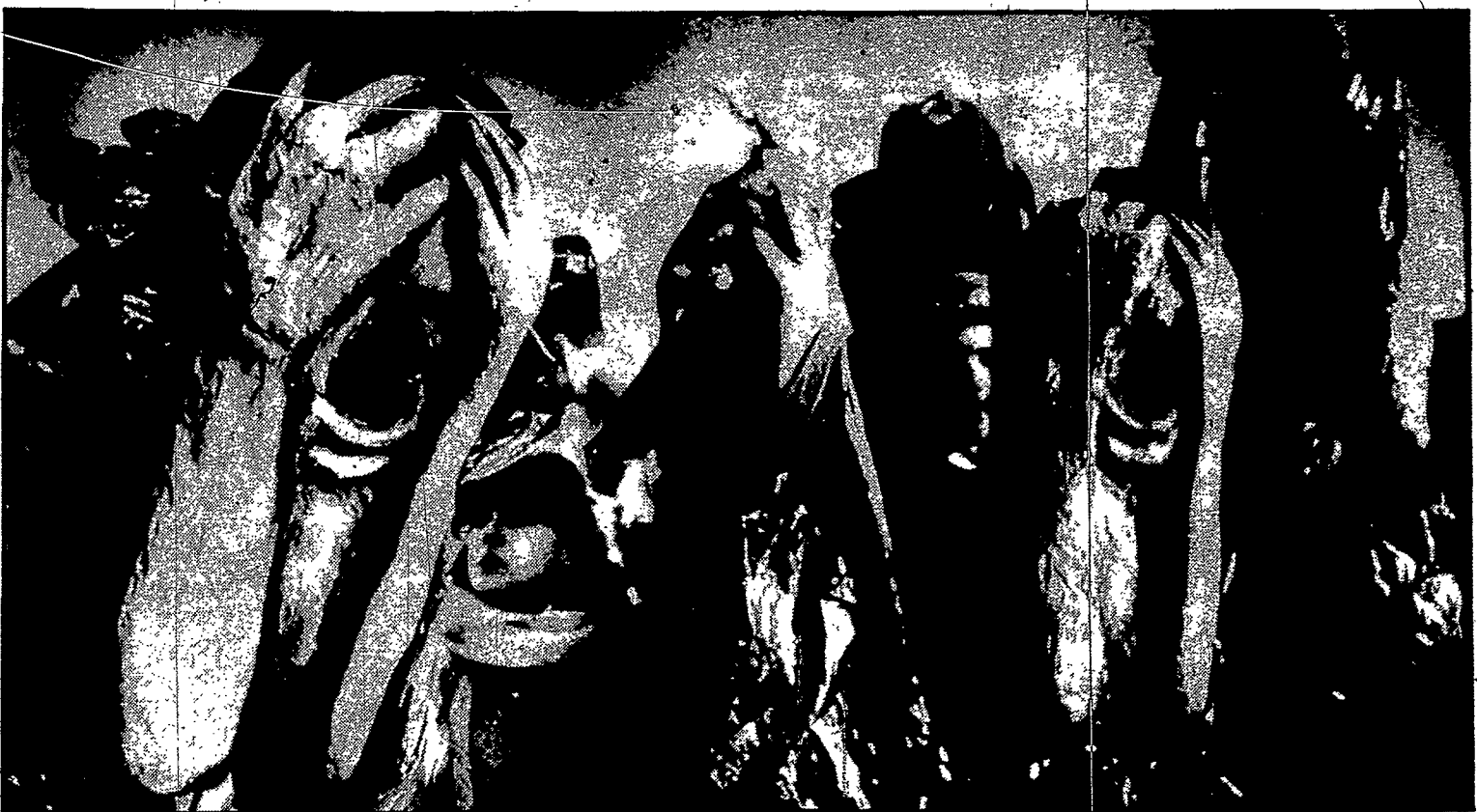
PUPPET PROTEST — Protesters opposed to U.S. aid to El Salvador used puppets to emphasize their message, "Stop the Slaughter," during a rally outside President Bush's vacation home in Kennebunkport, Me., Saturday, Dec. 23. The puppets had been brought to the rally from Vermont by the Bread and Puppet Theatre.

Along with the draft, the catechism commission sent bishops form sheets to submit individual amendments to the text and a separate set of form sheets to answer a series of general questions about the completeness, precision and style of the whole document and of each of its major sections.