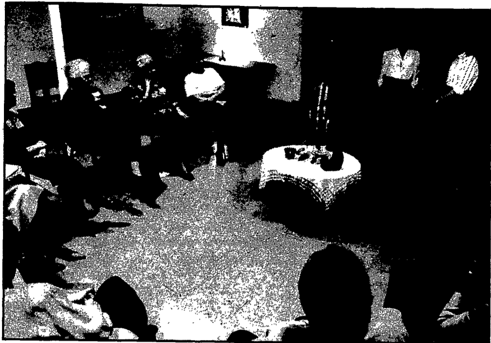
Sister Hilda Blade (top right, center) directs two women in role-reversal during the first of a four-part series entitled "Gospel Women Today."