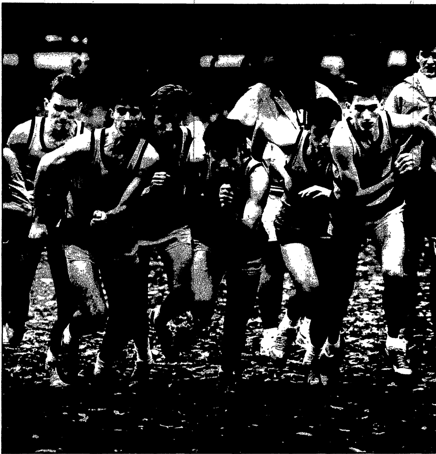
Members of the McQuaid cross-country team show different expressions of determination at the start of the boys' AAA-2 race of the McQuaid Invitational at Genesee Valley Park. The Knights finished fifth in the event. More than 4,000 runners competed in 21 races throughout the day.

The McQuaid Invitational featured more than 4,000 competitors from schools in Canada and the eastern United States.