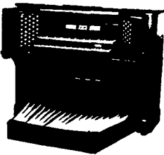
ADC 5000 Drawknob

Joseph Shale INC. Country Club Plaza East Rochester (716) 385-6530