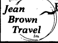
Jean Brown Travel

OTHER DATES ARE AVAILABLE ALL SPACE IS LIMITED $100.00 Deposit holds your reservation