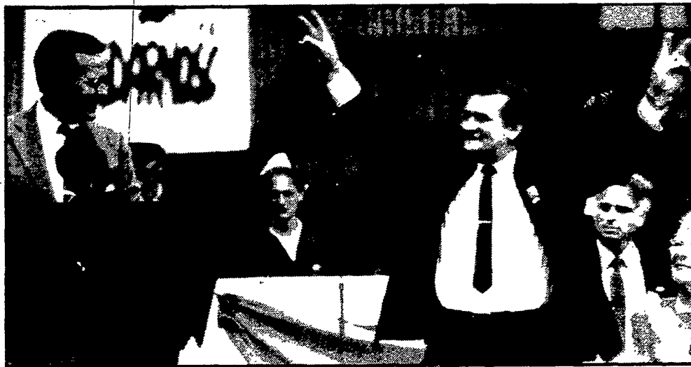
In Gdansk, Poland, Solidarity leader Lech Walesa (right) salutes President Bush with the "V" sign after Bush's recent speech in front of the Lenin Shipyard and the monument to the workers who died in the 1970 strikes in Poland.

diplomatic relations," Joaquin Navarro-Valls, Vatican press spokesman, said at the time.