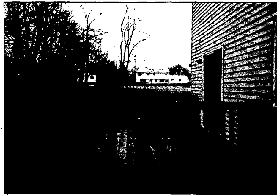
"Every Deck We Build is Picture-Perfect"

Other size decks available at similar discounts.