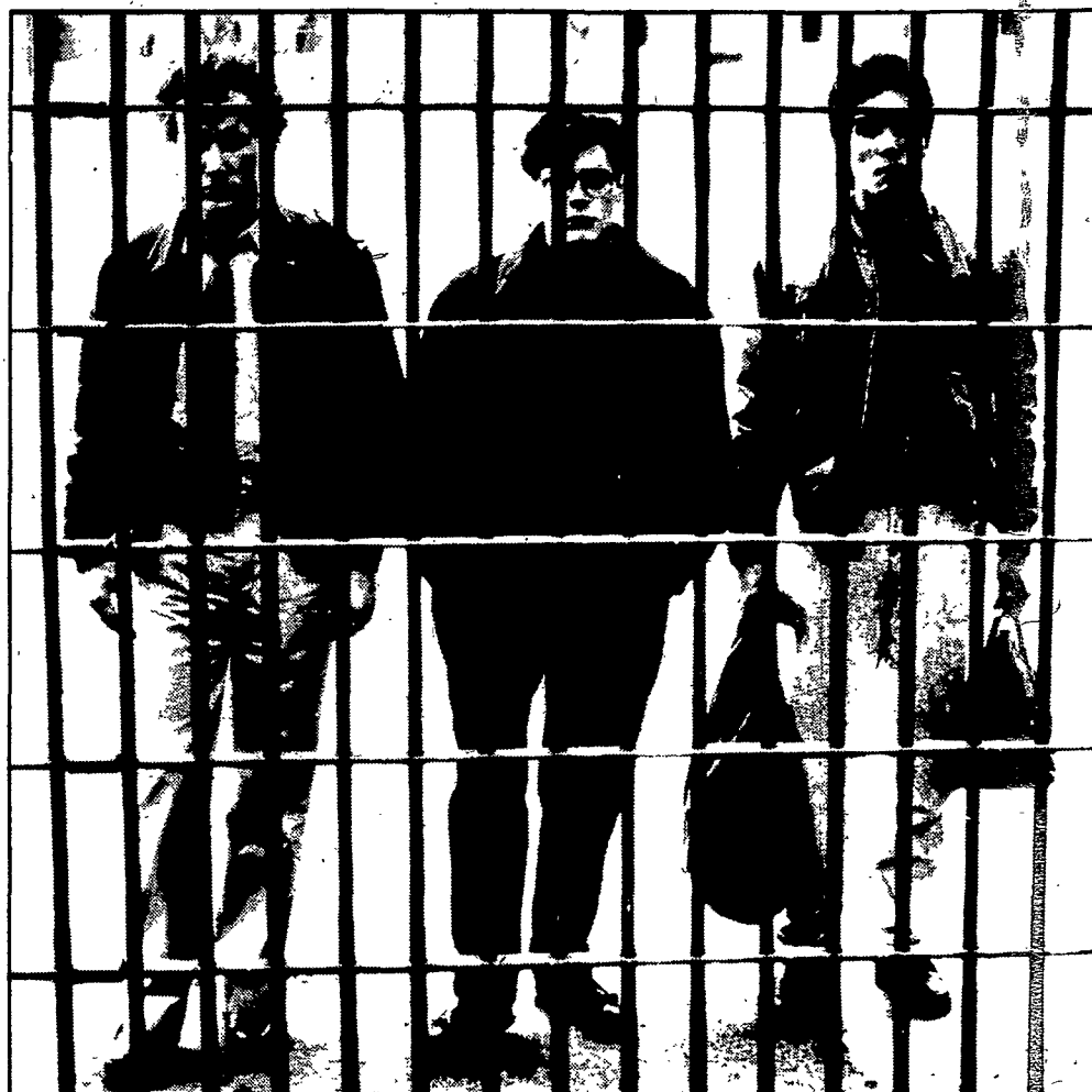
James Woods as a onetime '60s idealist lawyer named Eddie Dodd (left), Robert Downey Jr. as Roger Baron (center), and Yuji Okumoto as Shu Kai Kim (right) wait for a prison gate to open on the day Kim wins his freedom in "True Believer."