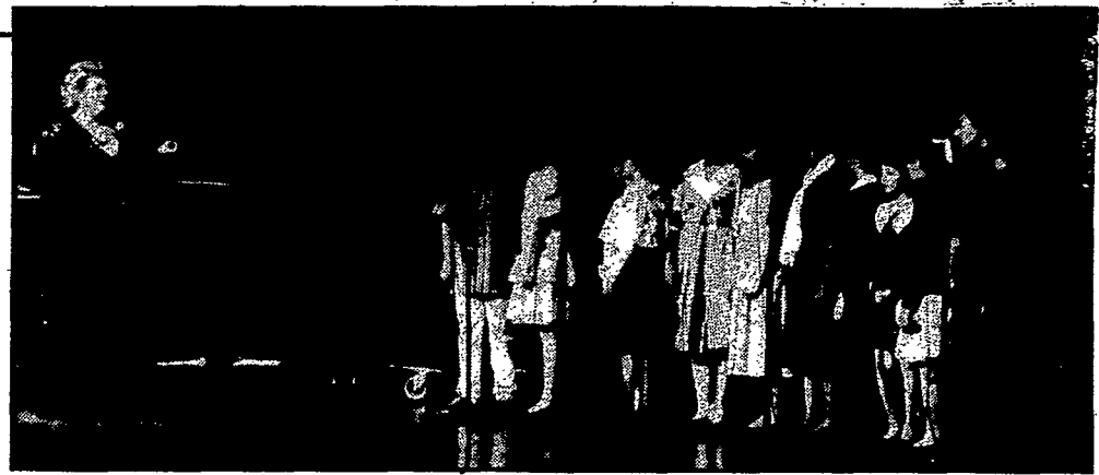
Singer Rosemary Clooney joins in a few carols with students from St. Joseph's School in Penfield during the evening performance of her White Christmas Show at the Eastman Theatre, Dec. 11. Approximately 85 students from several diocesan schools took part in the holiday show, which was a fundraiser for the Founders Club of the Sisters of Mercy of Rochester.