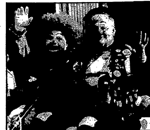
What is a parade without clowns?

MEETING: Rosary Society of Our Lady of Mercy Church, 36 Armstrong Rd., Rochester; 7:30 p.m.; holiday microwave hors d'oeuvre