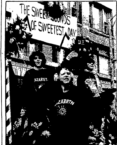
Nazareth Academy students sing a variety of holiday tunes.

nity of the Immaculate Conception; begins with musical prelude at 5:10 p.m.; Mass, 5:45 p.m.; reception 6:30 p.m.; St. Mary's, 15 St. Mary's Pl., Rochester; for information, call 716/232-7140.