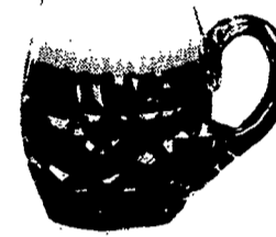
Hand Cut Irish Crystal