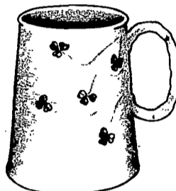
Belleck Parian China

Here's a way to wish "Good Luck" even before the toast!