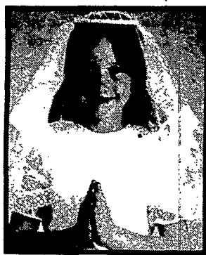
COMMUNION SAMPLES AVAILABLE FOR SCHOOLS AND RELIGIOUS ED. COORDINATORS