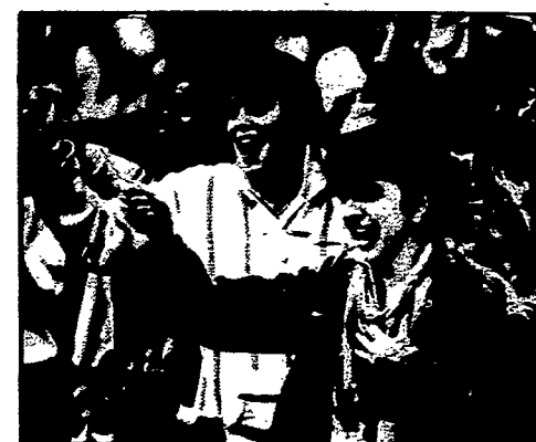
Mercy's fans were on their feet after the Monarchs rallied to a win over Webster.