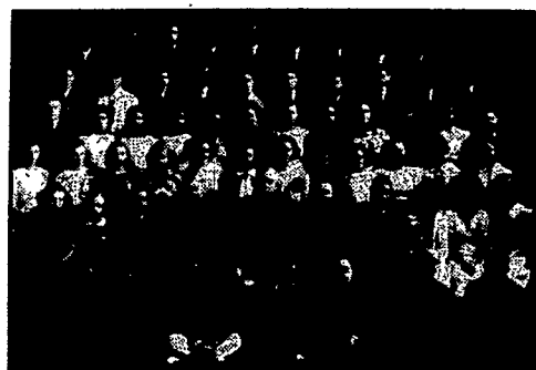
Corpus Christi's Class of 1938

Parishioners and friends are invited to participate in these events at St. Francis.