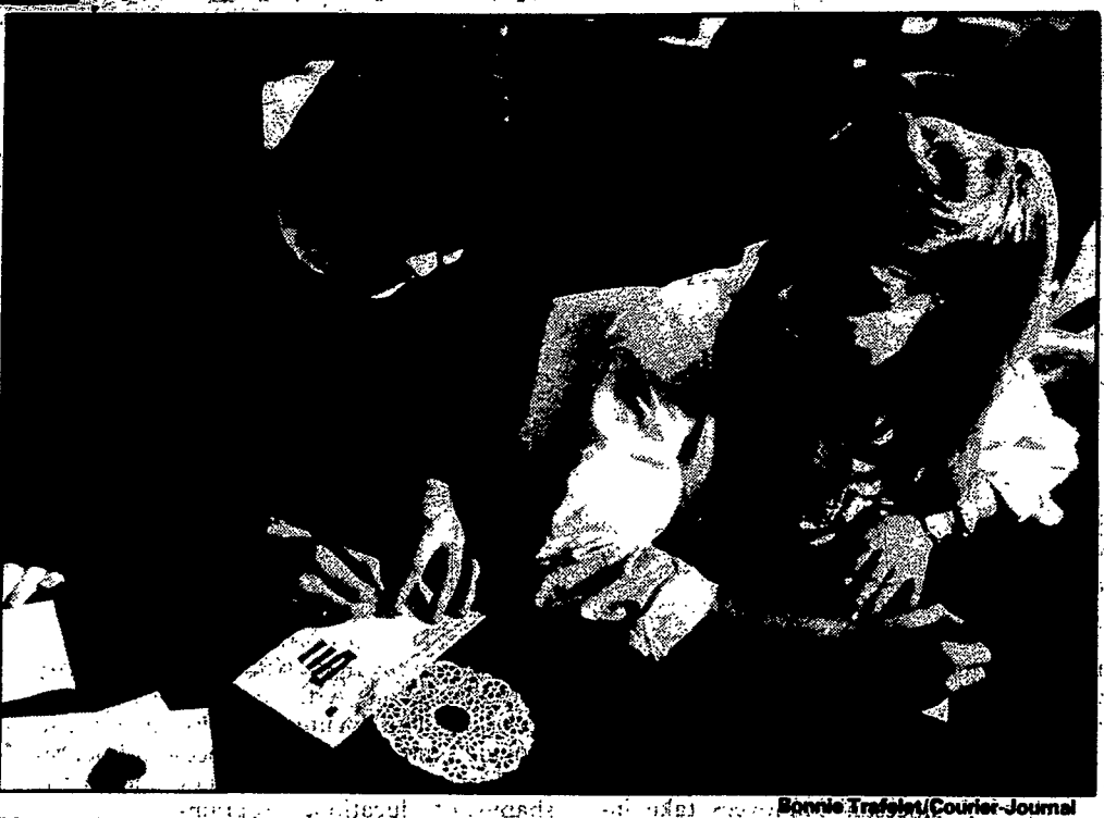
Mercy High School students prepared Valentine's messages for hostages in Lebanon as a project of the school's Community Service Club.

Club members also recently participated in