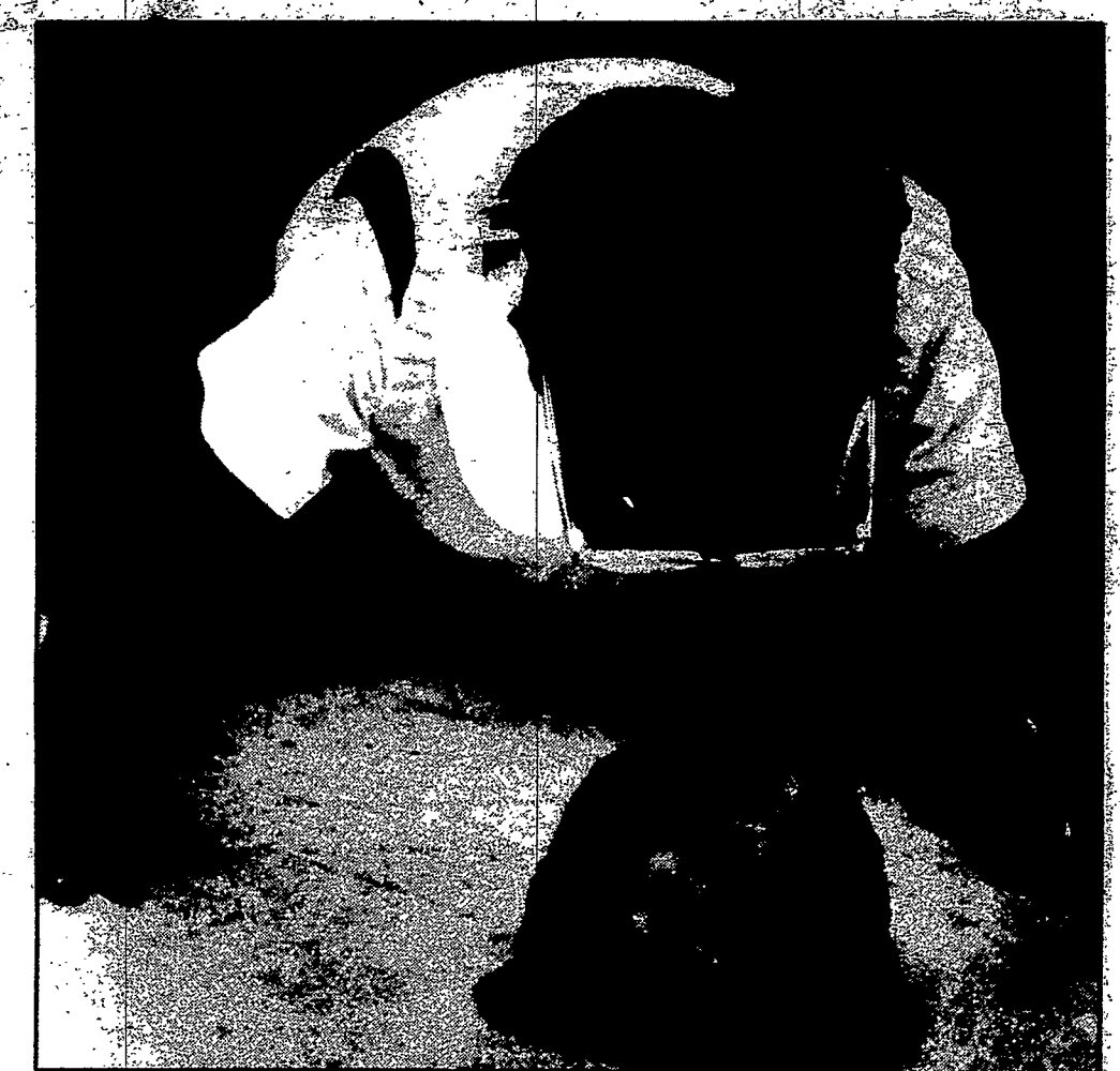
A student watched as Matt-the turtle crawled toward her. The zoomobile interpreter, mean while, explained the importance of a turtle's shell for the animal's protection.