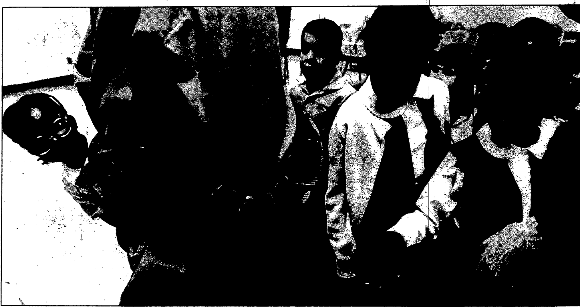
First graders at Our Lady of Perpetual Help Elementary school carefully examine a boa constrictor from the Seneca Park Zoo during the zoomobile's visit to their school