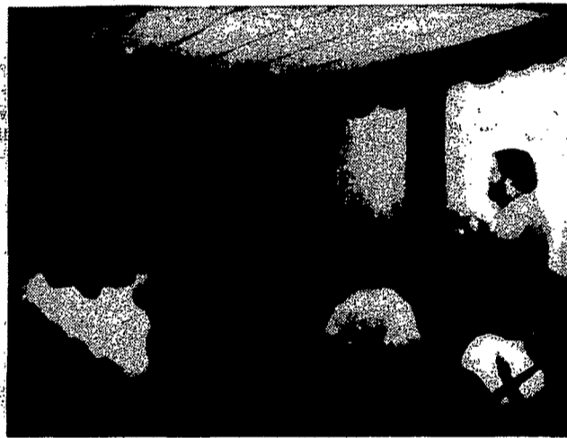
Annual "Leadership Day" for Parish Councils and Committees