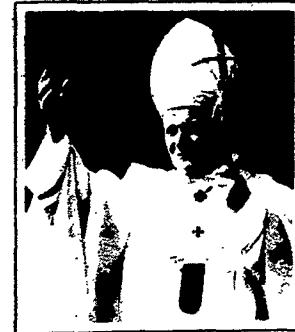
Pastoral Visit to the United States National Catholic News Service • Ignatius Press