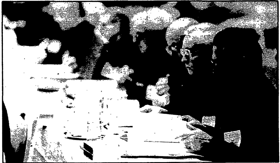
A report on troubling prospects for the Catholic Telecommunications Network of America was among the issues considered by U.S. bishops during last week's four-day gathering.

The network has shown substantial improvement since then, but "now that commitment is going to falter and maybe fall unless dioceses make that generous step" of affiliating, he said.