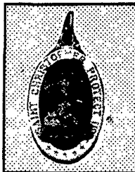
St. Christopher Medals